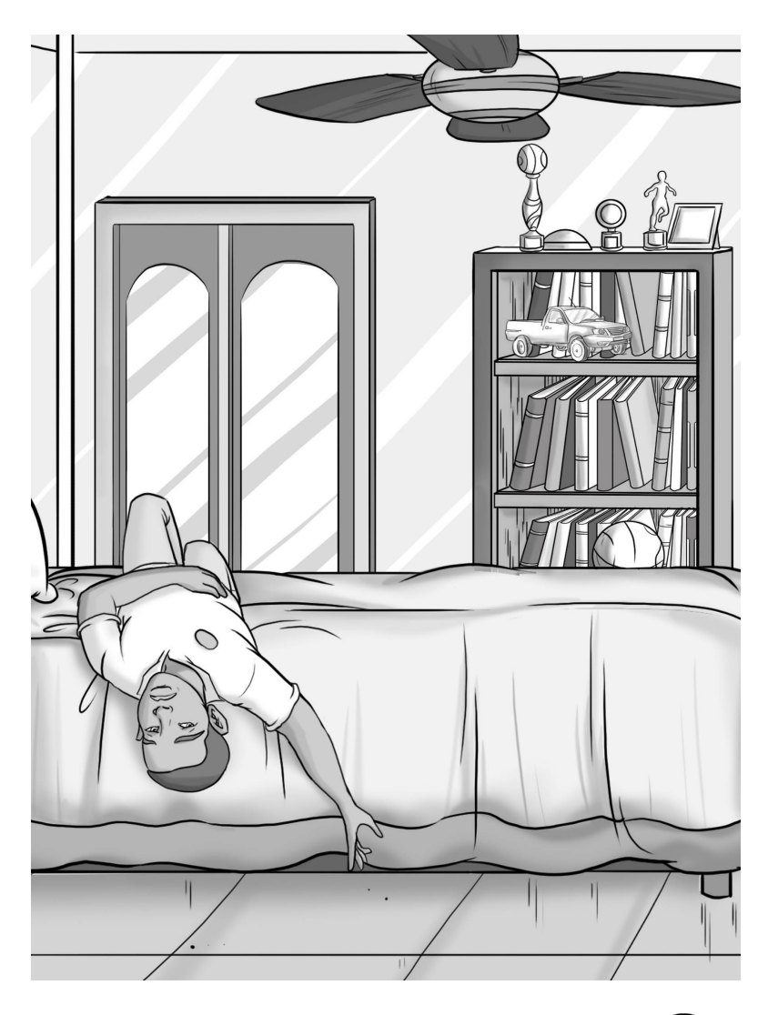
The Great Business of Summer