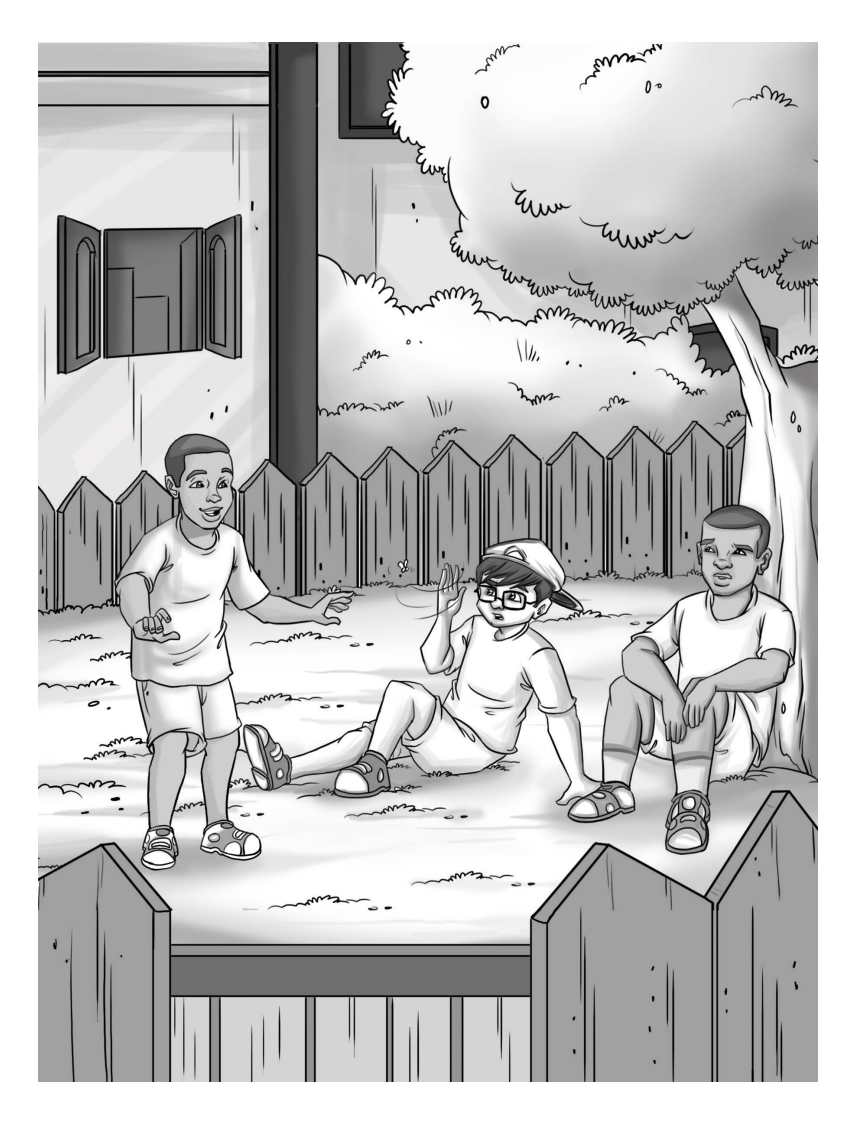
The Great Business of Summer